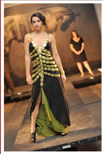
2010 DESIGN WINNER

Georgia Lions Lighthouse Foundation Better Vision. Better Hearing. Better Georgia.